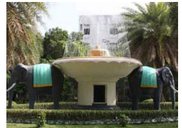
Manipal University © Uwe Skoda