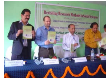
IIT Madras © Uwe Skoda